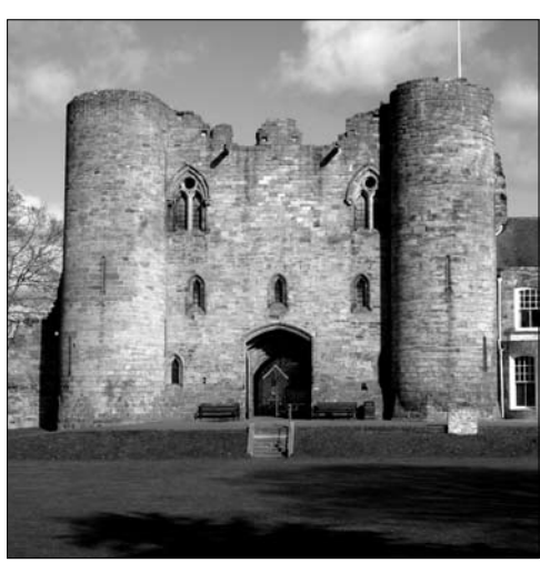
.... and in 2012