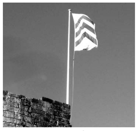
... and regularly flies over Tonbridge Castle

[An original copy of the 1300 edition of Magna Carta is on show in Maidstone until 6<sup>th</sup> September – see page 8.]