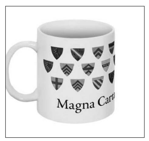
The triple-chevron crest of the de Clares appears twice on a souvenir mug...

In January 1265, 120 prelates, two knights from every county and citizens from the towns and the Cinque Ports met at Westminster to determine the fate of the royal prisoners and to discuss future government. The most important outcome was that Henry and Edward swore to observe the Magna Carta and this confirmation (known