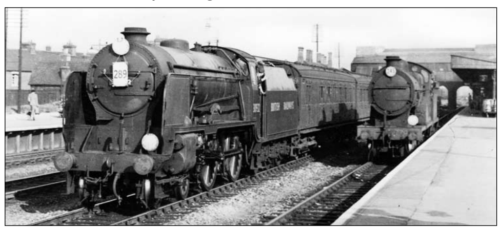
In June 1965 scheduled steam-hauled trains ceased to run through Tonbridge, 123 years after the first one came through. This photo was taken at Tonbridge Station in 1949.