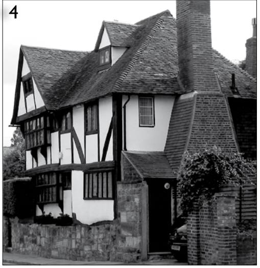
Spot the difference: Four photographs show how the appearance (and name) of one of Tonbridge's most historic buildings, the Port Reeve's House in East Street, has changed over the years. The first three are from postcards in the THS/Skinner collection: 1 'Ivy Cottage', postmark 1903; 2 'The Old Toll House', unknown date; 3 'The Portreeves House', postmark 1935. No. 4 shows the Port Reeve's House in 2008.