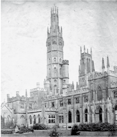
Hadlow Castle in its heyday. Much was demolished in the 1950s.

Local landmark: Restoration of Hadlow Tower is starting at last, following its compulsory purchase by TMBC and sale to the Vivat Trust for £1. Work on the Grade 1 monument – also known as May’s Folly – is expected to take about two years and includes the provision of a viewing gallery, holiday accommodation and exhibition space. English Heritage and the Lottery are funding the project.